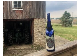
Edwin Brix Vineyard