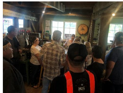
Eager guests gathering for the next taste!